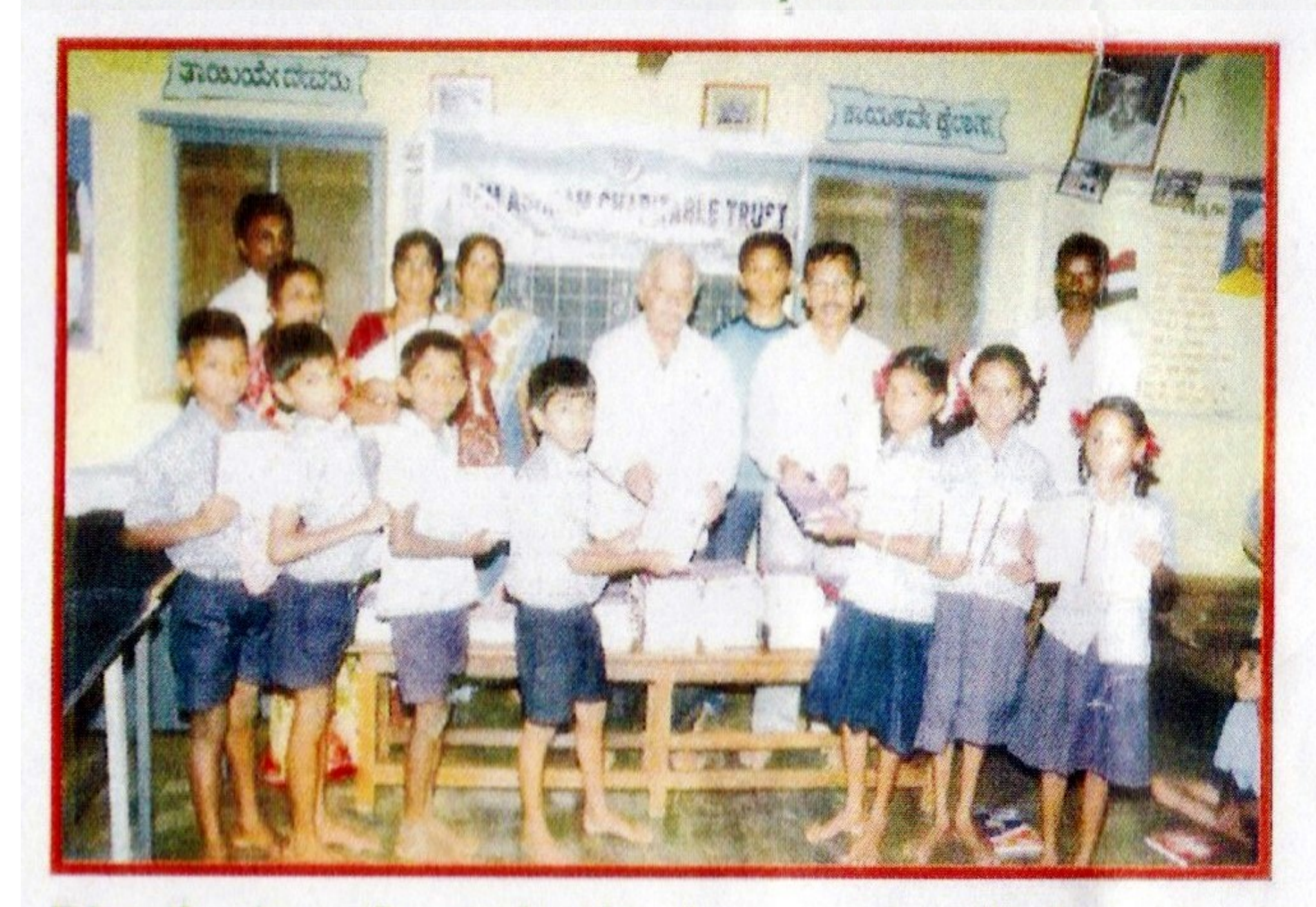
Distribution of note books & compass at Todur school