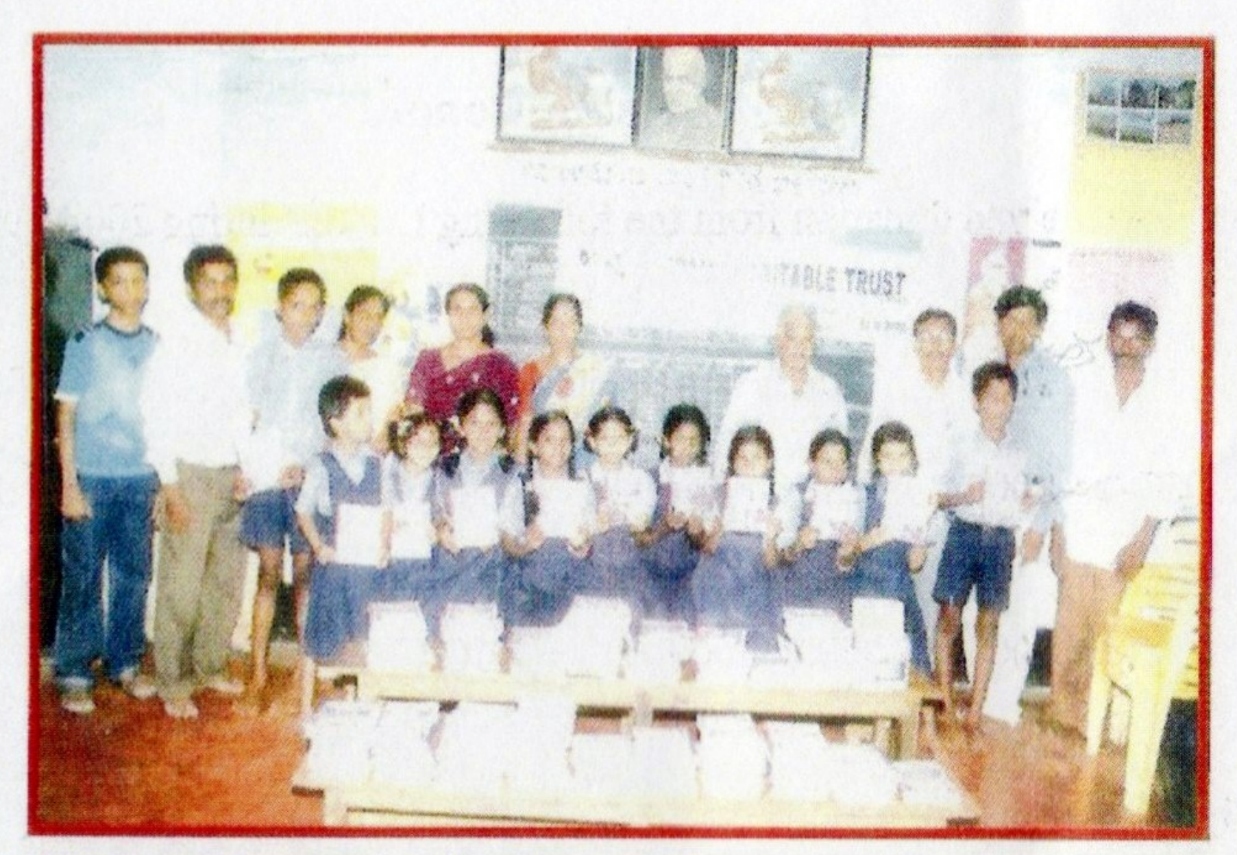
Distribution of note books & compass at Chendia school