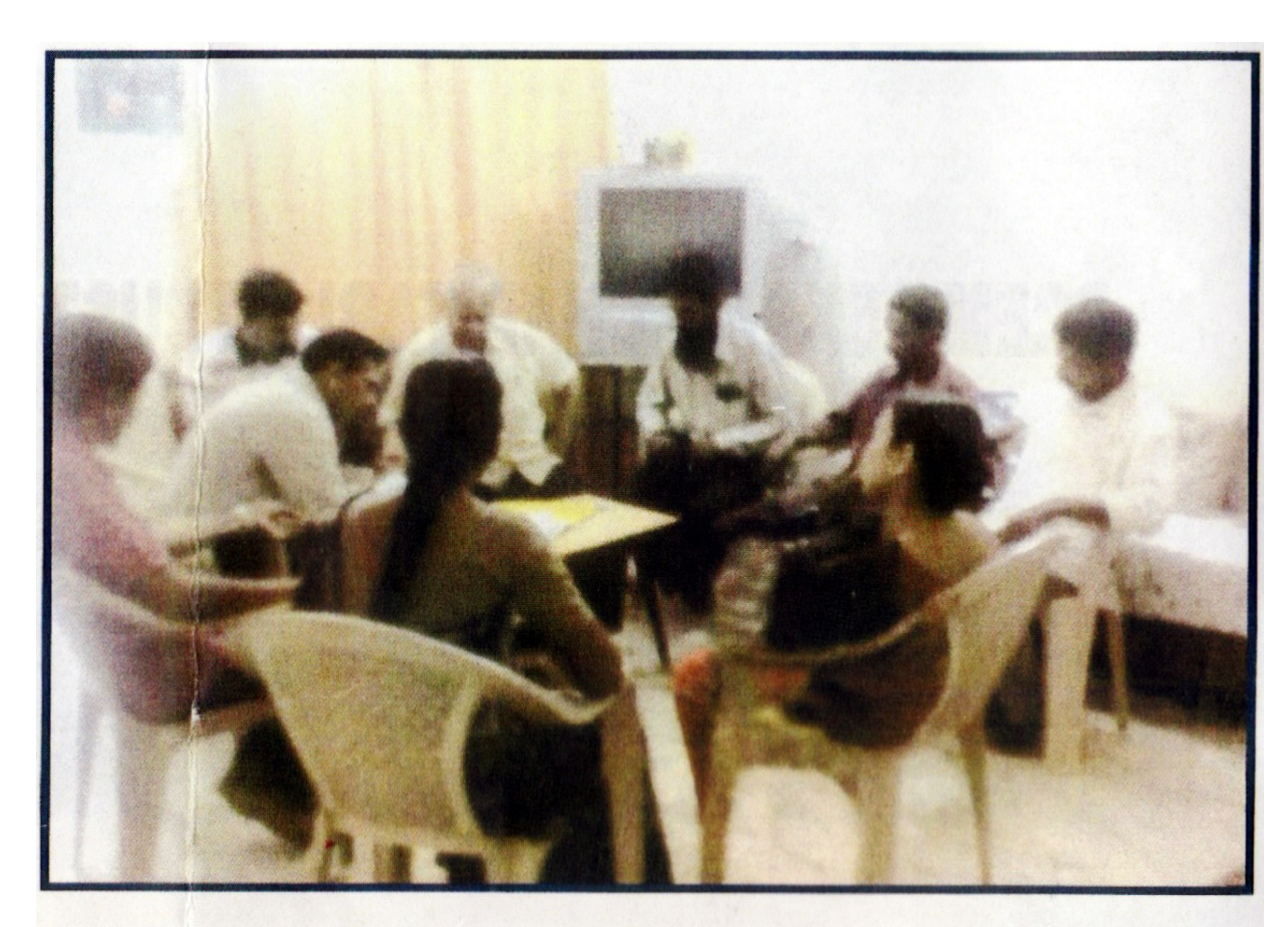
Board of Trustees Meeting in progress