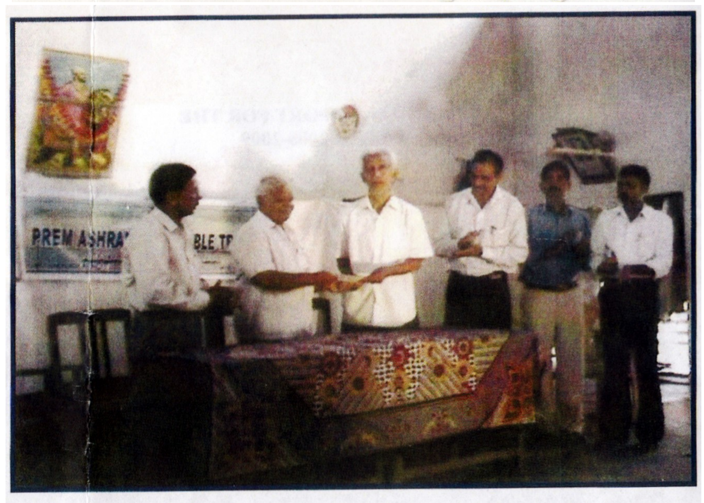
Three students from Shivaji Vidya Mandir, Asnoti are sponsored by Prem Ashram Charitable Trust