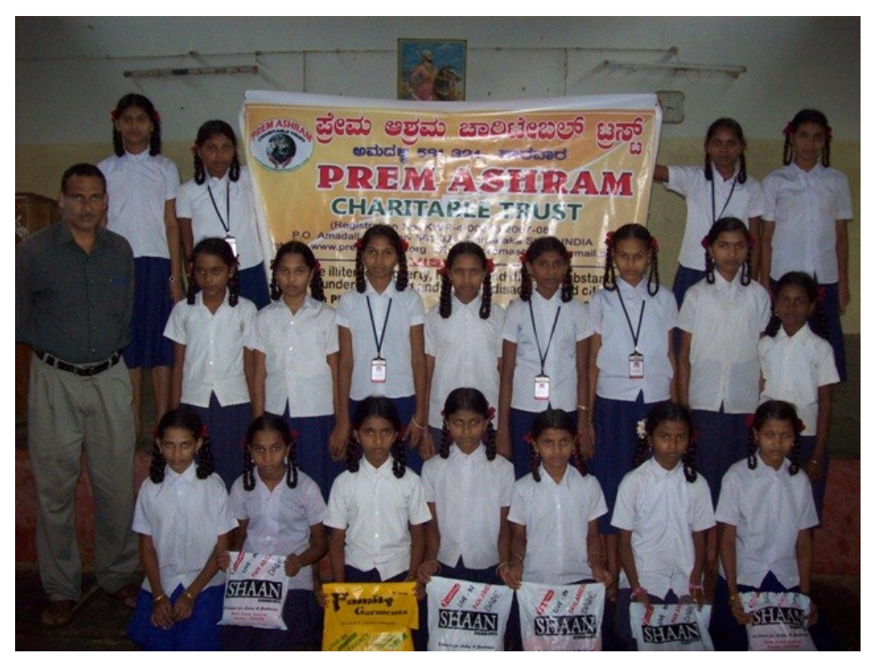
Nineteen female students residing in Girls' Hostel Managed by Prem Ashram Trust