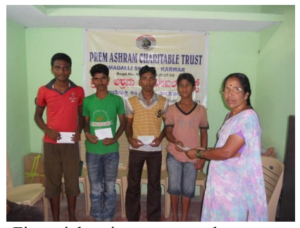
Financial assistance to students attending College