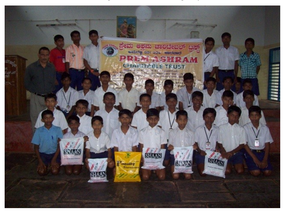
Thirty three male students residing in Boys' Hostel at Asnoti